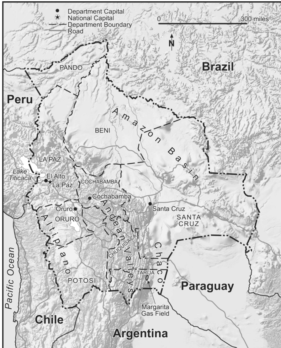
Figure 1: Map of Bolivia

ends by examining events since the 2003 Gas War, and ongoing conflicts regarding natural gas management in Bolivia.